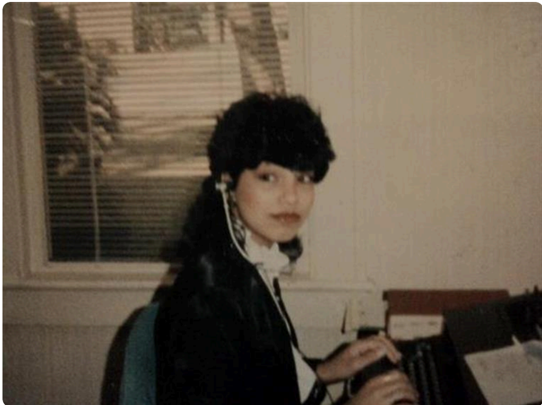
Working at Tampa Pathology 1985