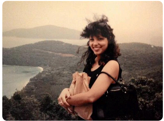
Overlooking Megan's Bay St Thomas