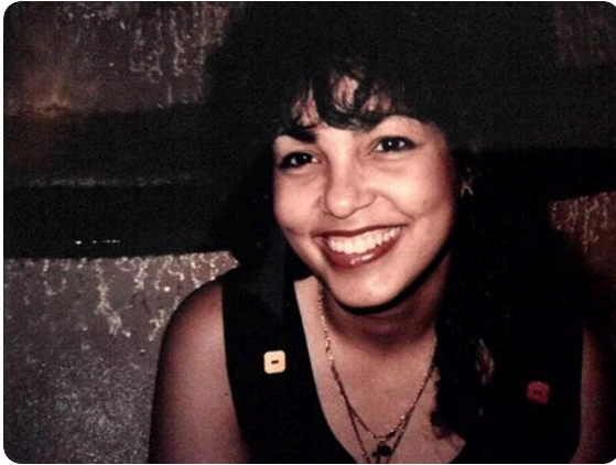
The smile I fell in love with