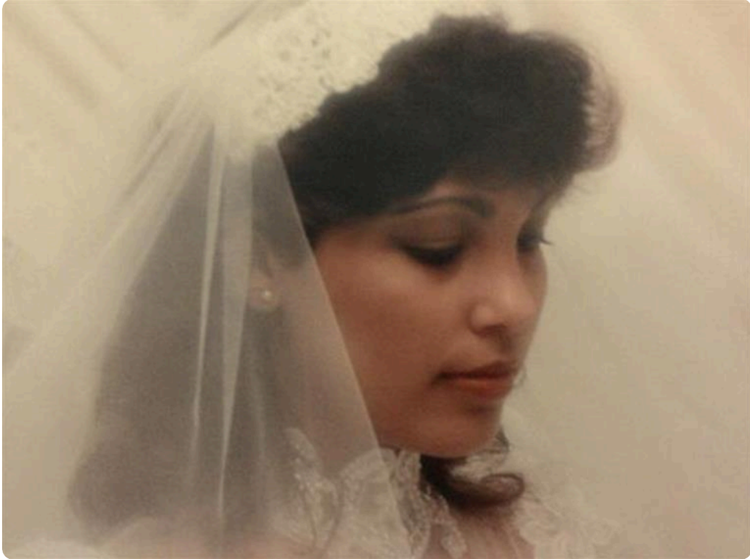
Our wedding day 1987