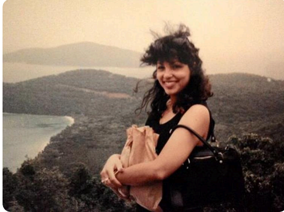
On a mountain top overlooking Megan's Bay St Thomas