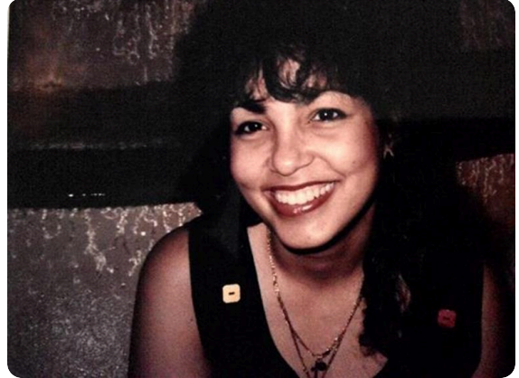
The smile I fell in love with