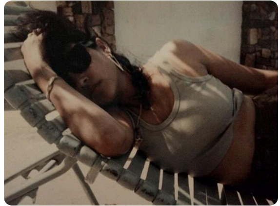
Taking a nap by the hotel pool in the Bahamas